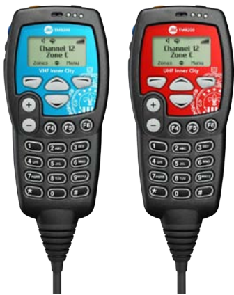
Custom lenses allow easy identification of multiple radios in the same vehicle*