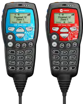
Custom lenses allow easy identification of multiple radios in the same vehicle*